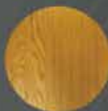
oak veneer mat