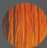
exotic veneer gloss